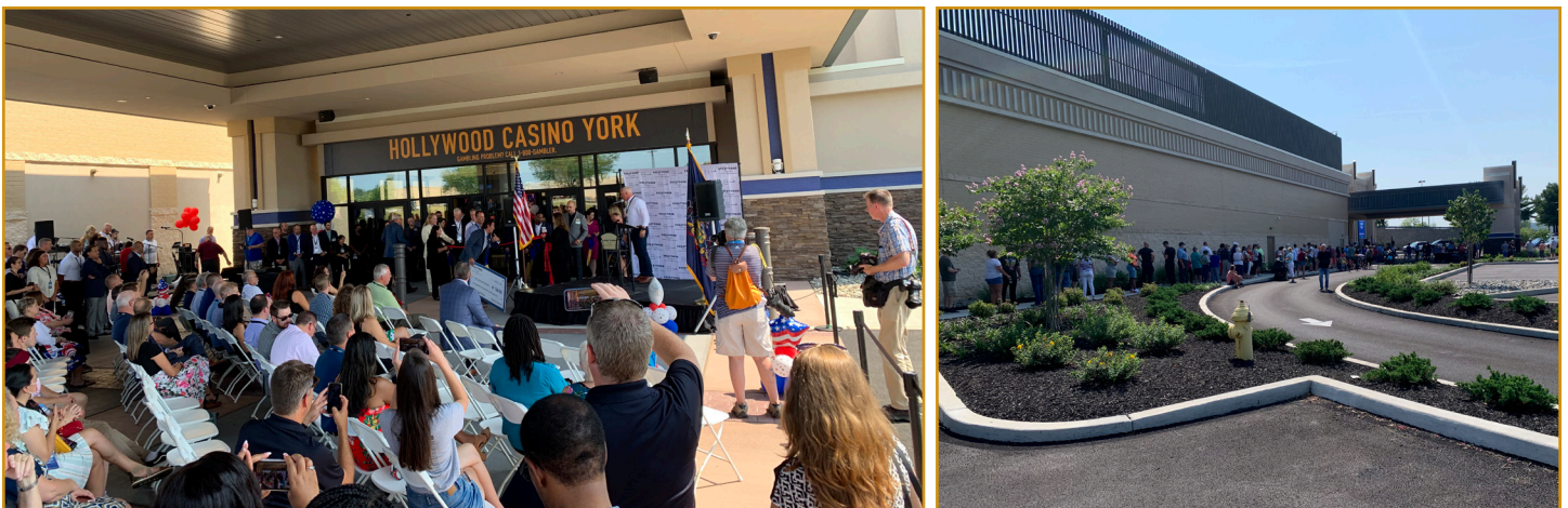
Hollywood Casino York Grand Opening

Category 4 facilities can have up to 750 slot machines and 30 table games at opening with an additional 10 table games permitted after the first year of operation. The right to apply for a Category 4 license was gained by these facilities through an auction process held by the PGC. The five winning bids ranged from just over $50 million to the minimum permitted bid price of $7.5 million.