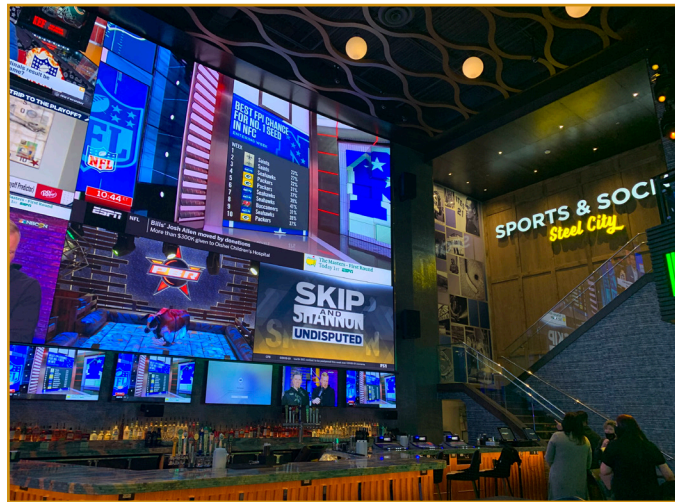
Live! Casino Pittsburgh Ribbon Cutting

Fiscal Year 2020/2021 continued to see growth in both the number of retail and online sports wagering operators and the corresponding growth in sports wagering revenue. With the addition of three new retail outlets that opened during the fiscal year (Live! Pittsburgh, Wind Creek Bethlehem and Live! Philadelphia), as of publication of this report, there are a total of 15 retail sports wagering locations. Additionally, there were three new online sports wagering sites that launched during the fiscal year (Hollywood Casino at Penn National Race Course with Barstool, Hollywood Casino Morgantown with BetMGM, and Wind Creek Bethlehem with BetFred). With the addition of an online sportsbook by Live! Philadelphia that began prior to the publication of this report, sports wagering websites currently total 13 in Pennsylvania.