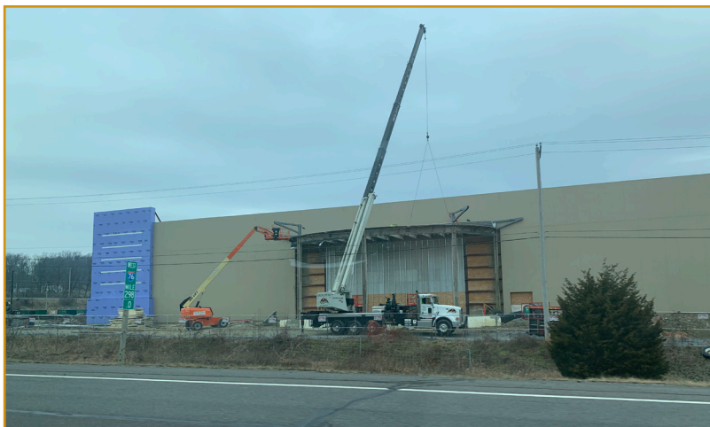
Hollywood Casino Morgantown Construction